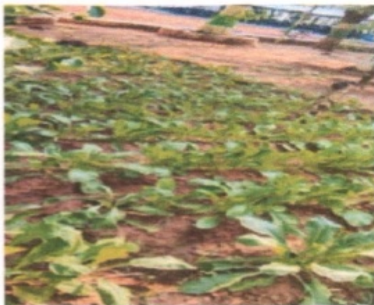
Radish ( Raphanus sativus )