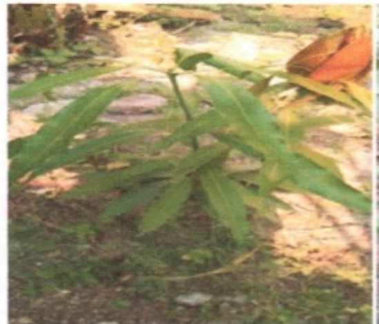
Mango ( Mangifera indica )