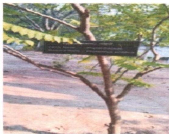
NelliMaram ( Phyllanthus emblica )