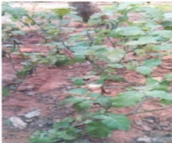
Brinjal ( Solanum melongena )

A plantation program was conducted in the college on 03.07.2018. Prof.N.Sundaramoorthy was the convener of Enviro Club. The member and convener along with Principal planted different kinds of plants inside the college campus. These herbal plants play a major role in environment which contains wealthy chemical compounds such as secondary metabolites and control pests inside the college for maintaining pest free campus..