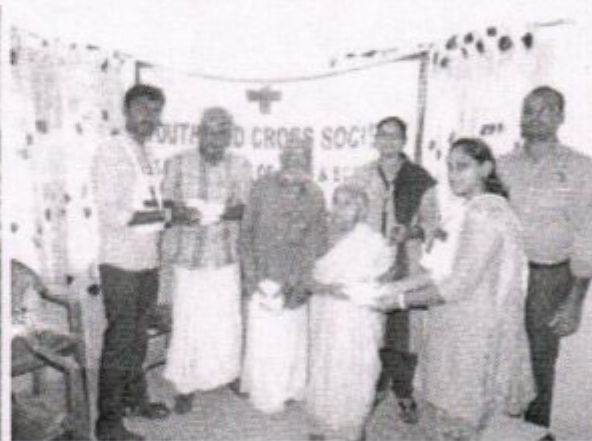
○ Our YRC conducted a one day camp at St Anne's Old age home gudiattam On 14 th February 2018 and extended our support to them.