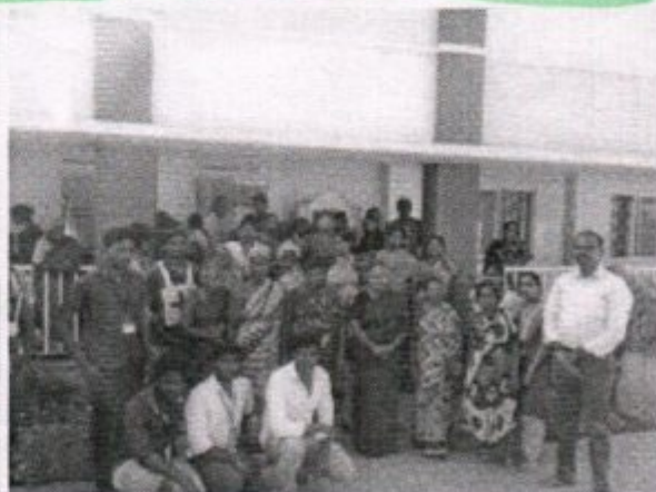
○ Three of our YRC Volunteers attended three days YRC study camp at Thiruvalluvar University from 21 st February to 23 rd February 2018.

Penhid PRINCIPAL K.M.G. COLLEGE OF ARTS & SCIENCE GUDIYATTAM - 635 803. VELLORE DISTRICT.