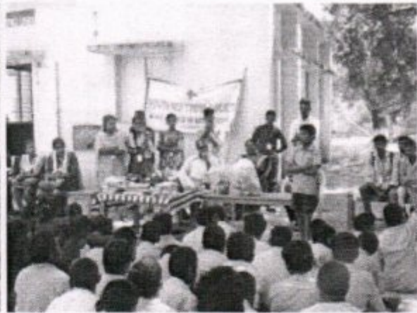
○ On 14.02.2018 Our YRC Conducted a one day camp at Poigai Red Cross old age home and fulfilled some of their needs.